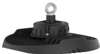
Abb. 1: EGH Gehäuse