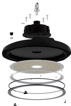
Abb. 3: Explosionszeichnung